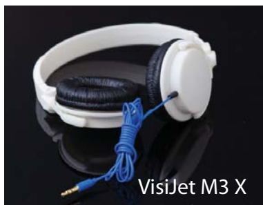
VisiJet M3 X

*DISCLAIMER: It is the responsibility of each customer to determine that its use of any Class VI certified VisiJet® material is safe, lawful and technically suitable to the customer's intended applications. Customers should conduct their own testing to ensure that this is the case.