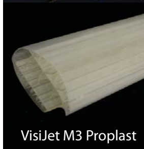
VisiJet M3 Proplast