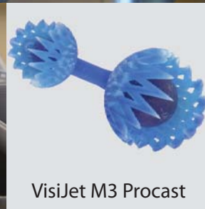
VisiJet M3 Procast

VisiJet M3 Plastic Materials for ProJet SD & HD