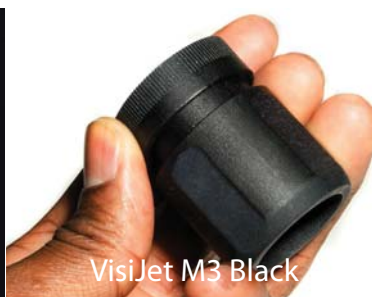
VisiJet M3 Black