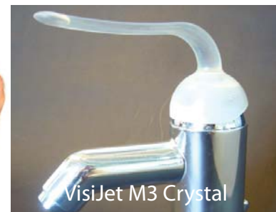
VisiJet M3 Crystal