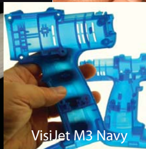
VisiJet M3 Navy